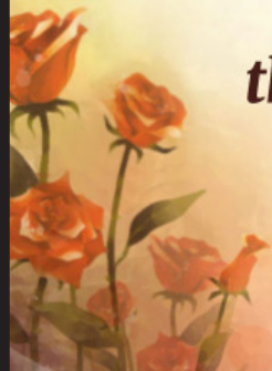
God creates the world. Genesis 1:1-2:25